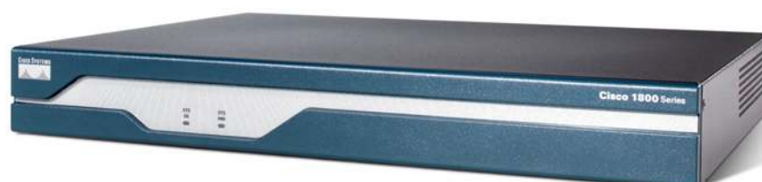
Figure 1. Cisco 1800 Series Integrated Services Routers

Support of high-density WICs (HWICs) is optional.